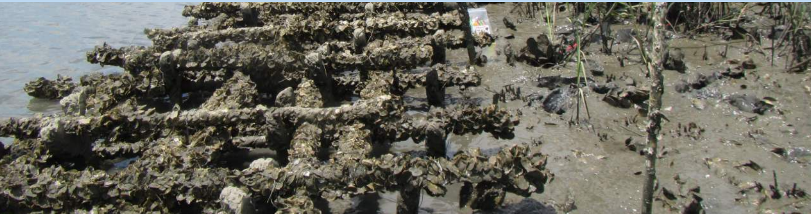
An Oyster Catcher installed at Carrot Island.